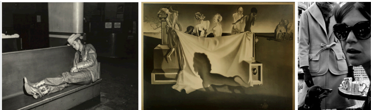
from left to right and top to bottom