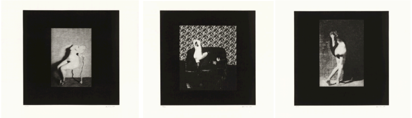
from left to right | David Lynch